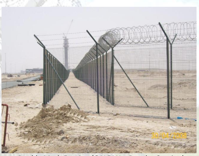
Double Mesh Fencing (GALFAN + Powder Coating).