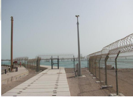
In a Middle East location near coastal

adapting the ORIGINAL GALFAN 95 Zn /5 AL Coating.