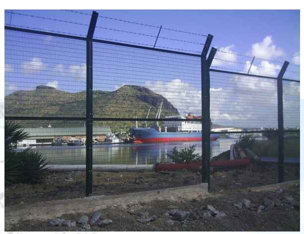
Coastal Fencing (Port)