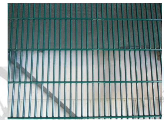
75mm x 12.5mm x 4mm diameter GALFAN + Powder coated