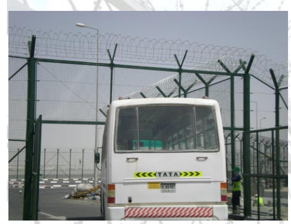
Fully computerized fencing system with Integrated Auto gates, CCTV Post/cameras and sensors