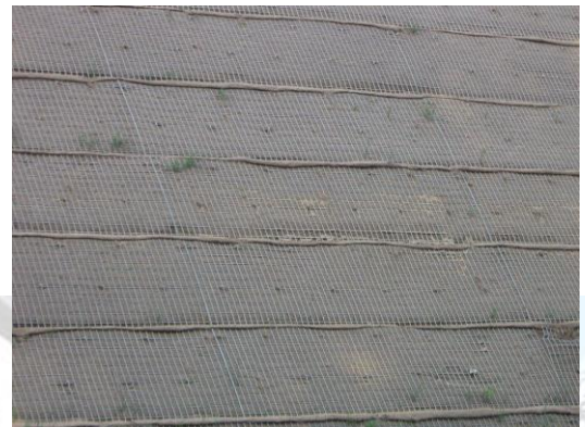
Retaining wall (GALFAN Coating)