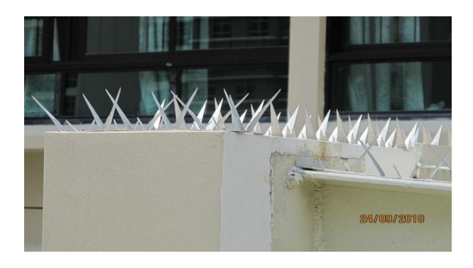
Anti-climbing spikes on Perimeter / parapet Spikes On Wall (Top) on Roof (below)