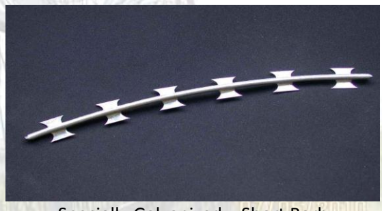
Specially Galvanized – Short Barb