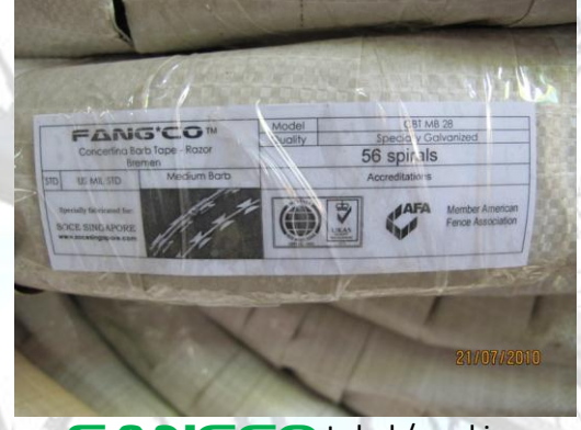
FANGGO Label / packing