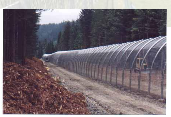
Juvenile Institution – soft approach