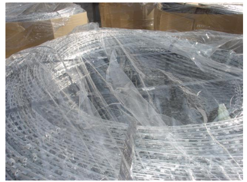
FANGGO Packing palletize