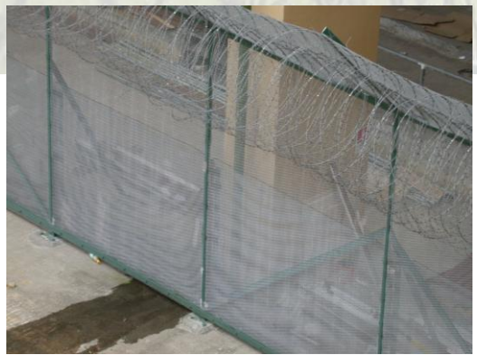
ICQ security Fencing